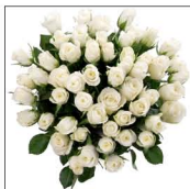
WHITE ROSE BUDS WRB 039