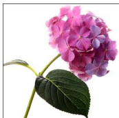
PURPLE HYDRANGEA PH 120