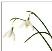
SNOWDROPS SDP 031