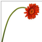
ORANGE GERBERA OGB 008