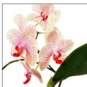
SPECKLED ORCHIDS SPK 041