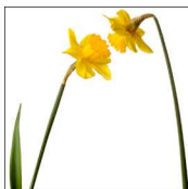
DAFFODILS DAF 041