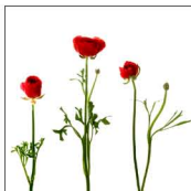
3 RED RANUNCULUS RR 300