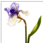
ORINOCO FLOW ORF 005