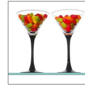
SWEETS TO THE SWEET SWT 015