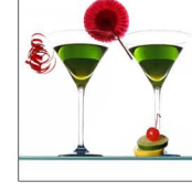
CARNIVAL CVL 059