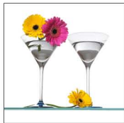
SPRING COMPLEMENT SPC 042