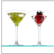
STRAWBERRY FIZZ SGF 043