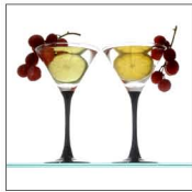
SOUR & SWEET SSF 072