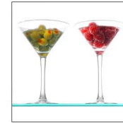
RASPBERRY FIZZ ROF 250