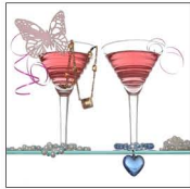
GIRL TALK GT 035