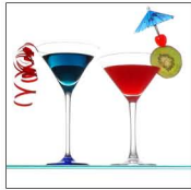
PARTY PTY 200