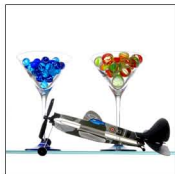
TOYS FOR BOYS TFB 093