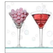
BUBBLY BB 159