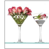
ROSEWATER RW 020